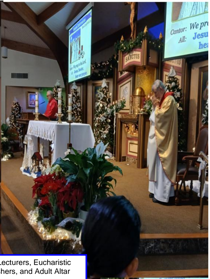
Knights are Lecturers, Eucharistic Ministers, Ushers, and Adult Altar Servers.